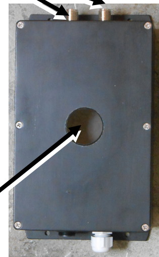
5MP Embeddable Smart \mu PTZ Camera

Rugged, weatherproof cast aluminum case painted flat black, approx. 8"H x 6"W x 3"D, for Boundless' Traffic Barrel Shell, Faux-Rock Shell, Faux Meter Box , or your DIY enclosure